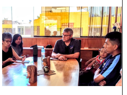
STUDENTS AT JUAN PABLO II MEET TO LEARN MORE ABOUT THE SCHOLARSHIP OPPORTUNITY