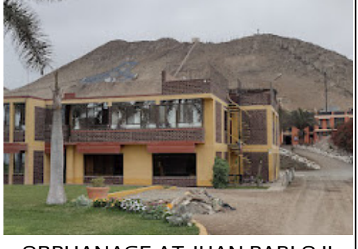
ORPHANAGE AT JUAN PABLO II LURIN, PERU